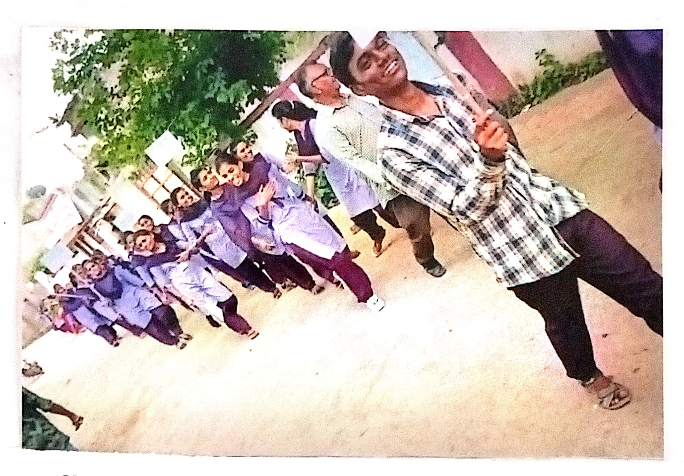
Cleanliness Drive at Sawarkhed Village on Dated 03/10/2019