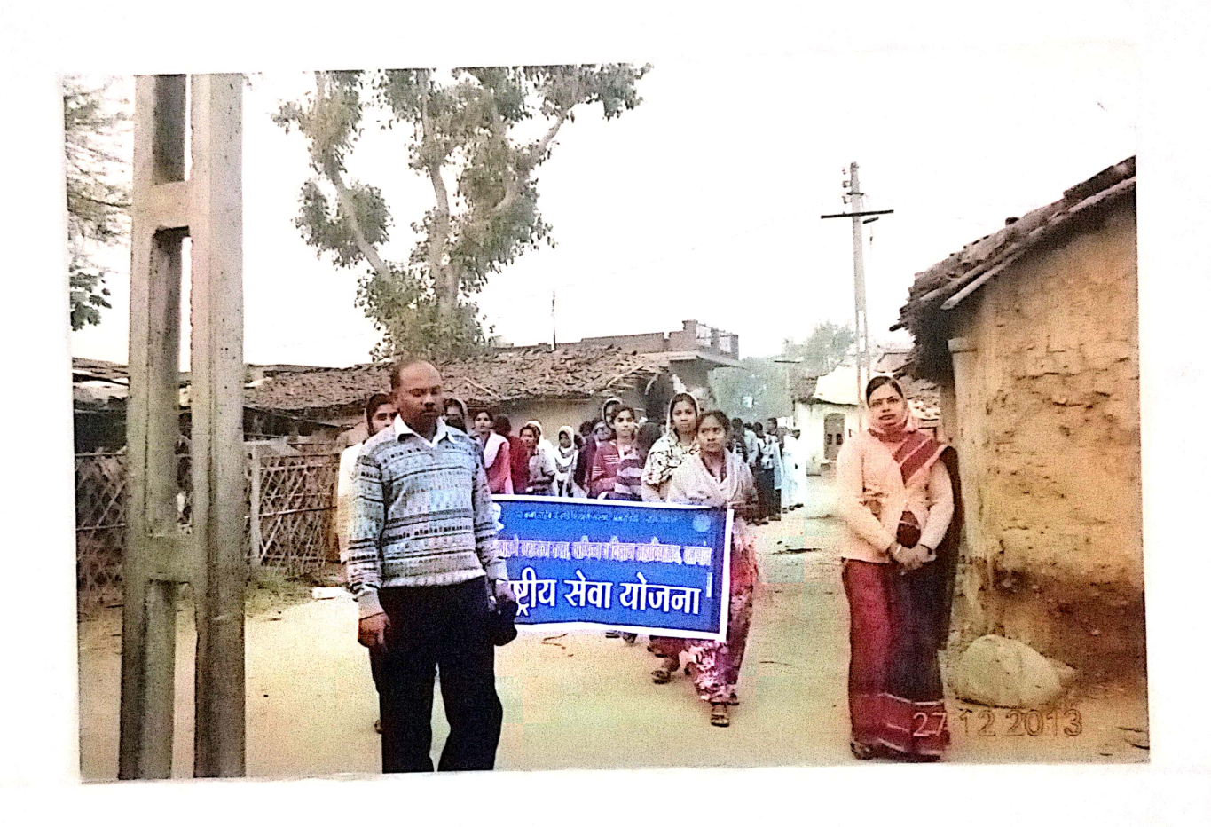
College Organised Rally For Community Enlightenment at Ozarkheda on 18/9/2018,