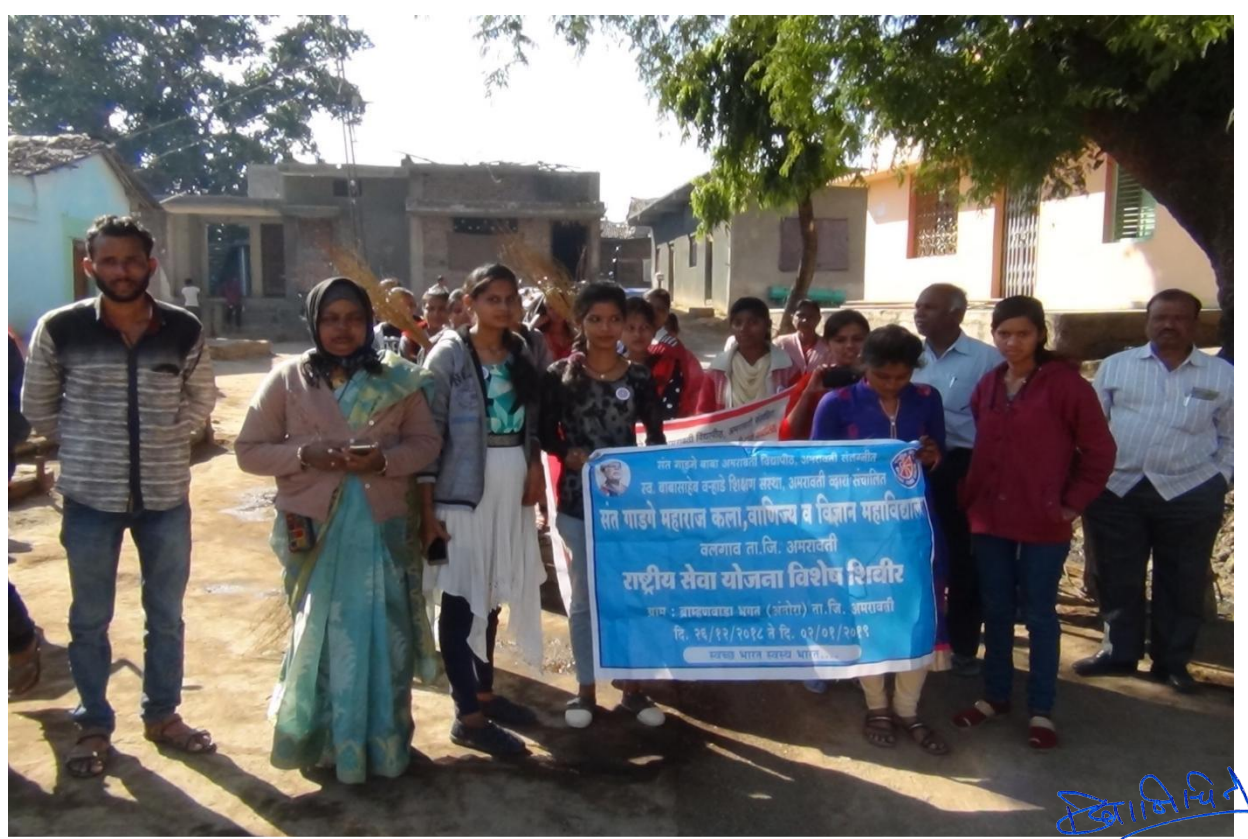
NSS Students Circulating Message of Cleanliness at Bhahmath Gladle Manaraj Art's, Sant Gadge Manaraj Art's, Gommerce & Science College WALGAON, Dist. Amravati.