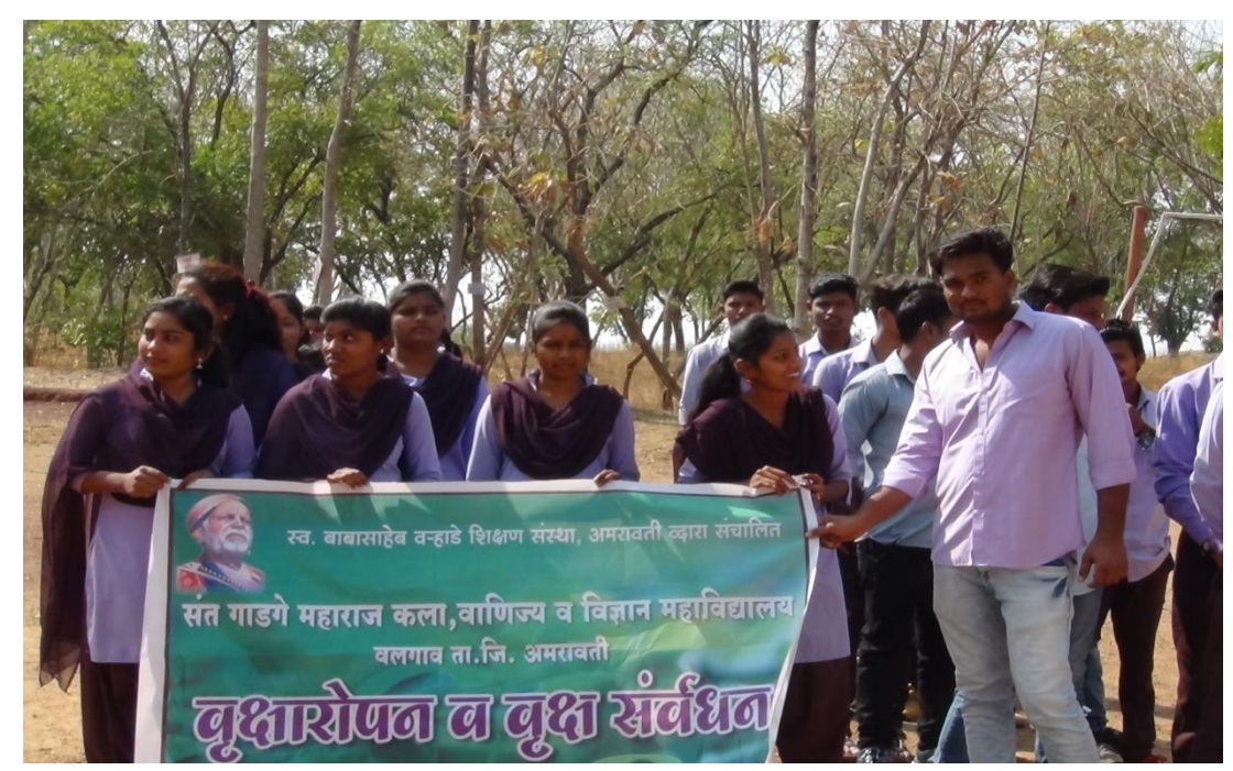
Giving messege of "Tree Plantation, Save Trees"