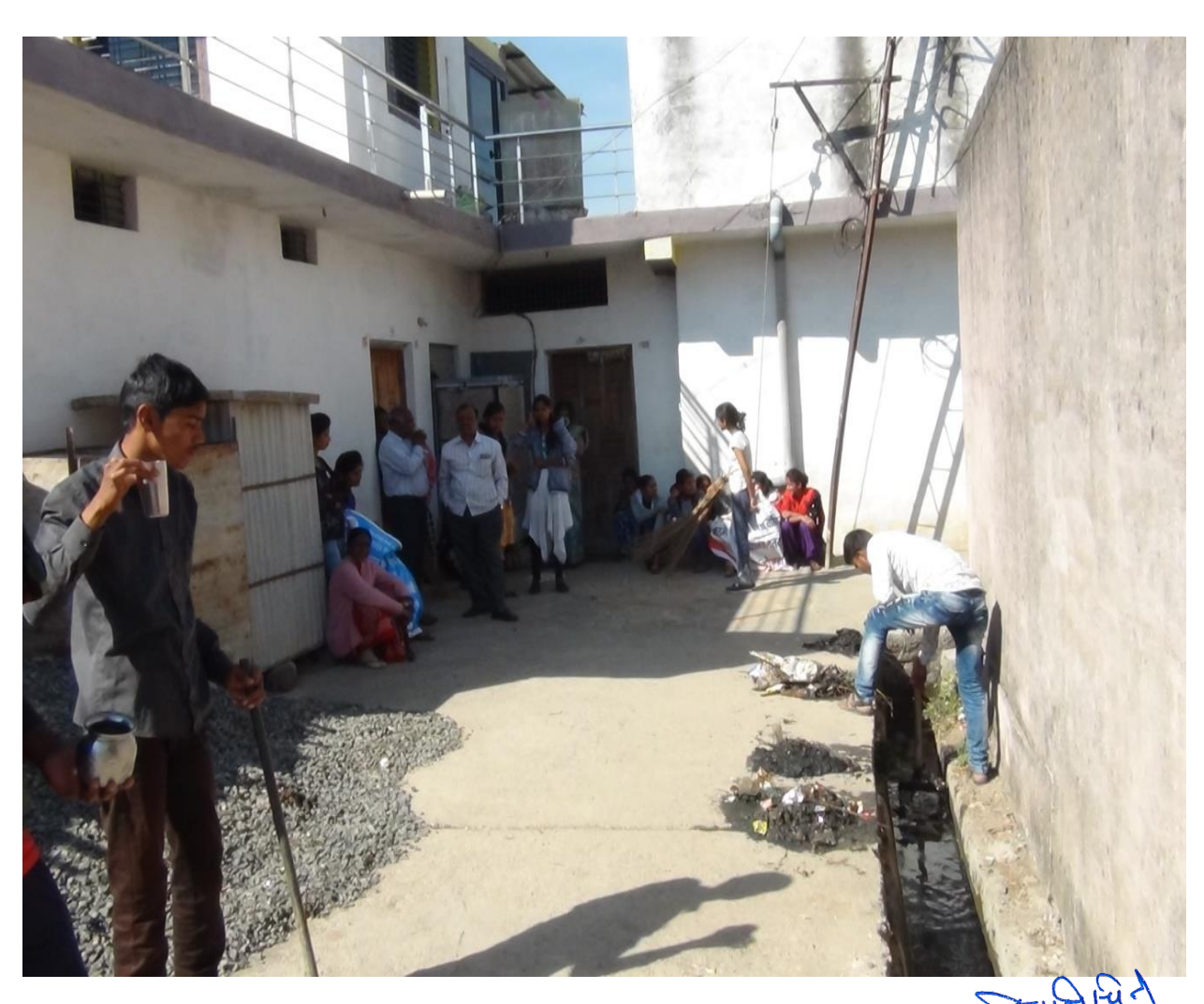
NSS Students Cleaning Drainage at Bhrahmanwada L Under Village Cleanliness Drive. sant Gadge Maharaj Art's, Commerce & Science College WALGAON, Dist. Amravati.