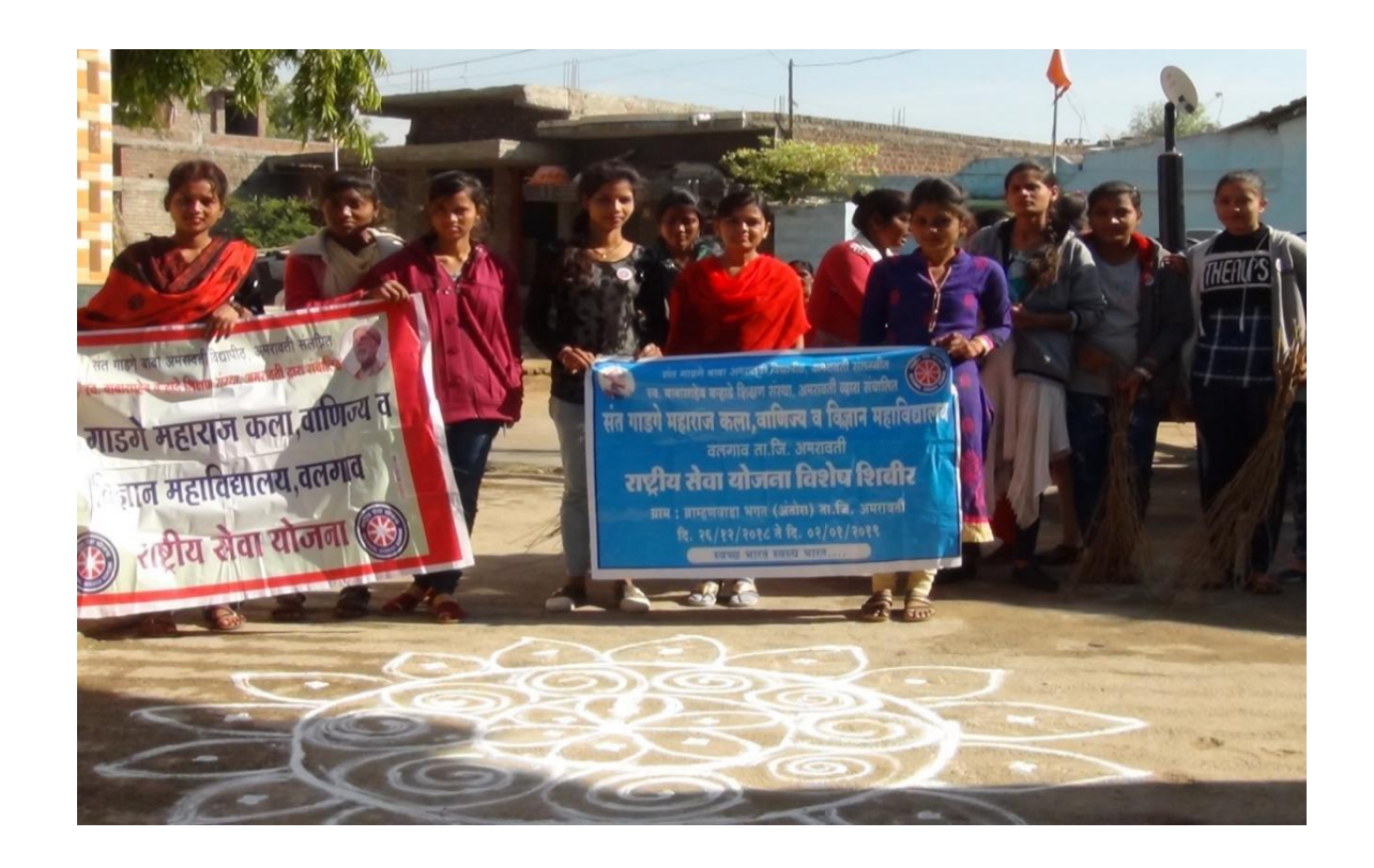
NSS Volunteer Circulating the massage of Cleanliness.