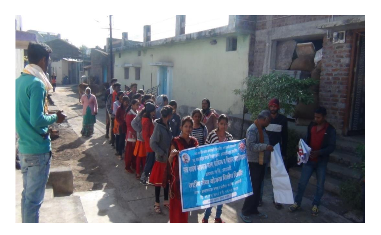
Rally to Generaize the messege of cleanliness at Bhahmanwada Bhagat.