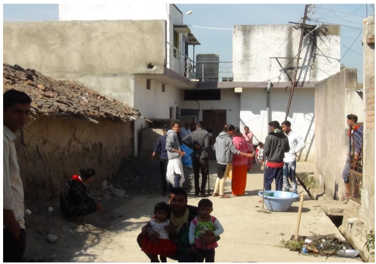
College & Village Cleaniness Campaign by NSS Volunteers under NSS Unit